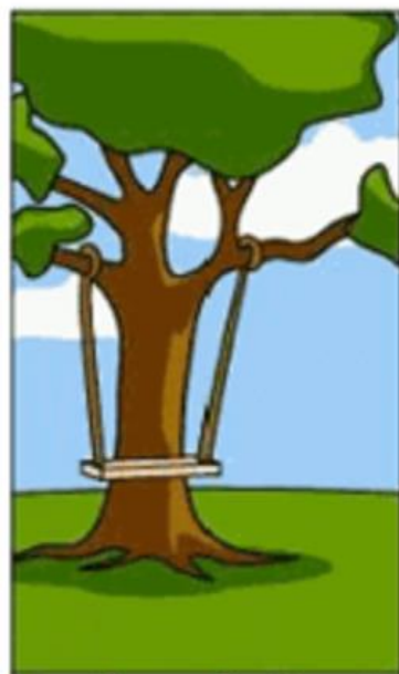
How the project leader understood it