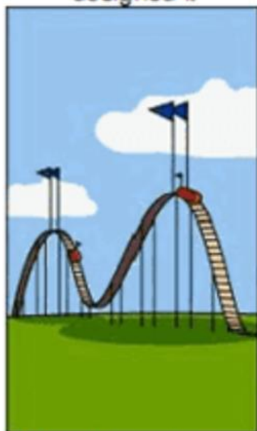
How the customer was billed