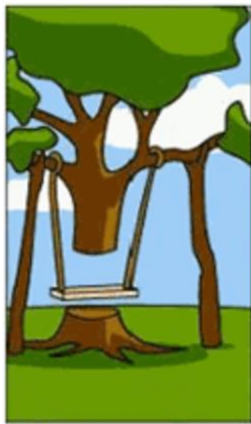
How the engineer designed it