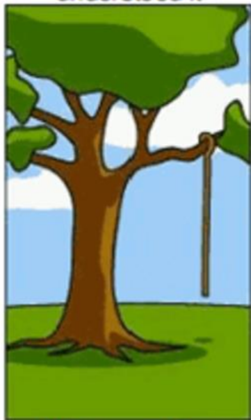
What operations installed