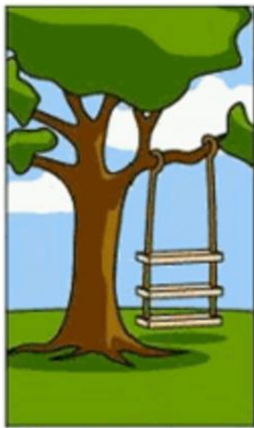
How the customer explained it