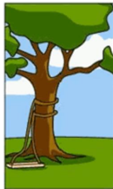
How the programmer wrote it