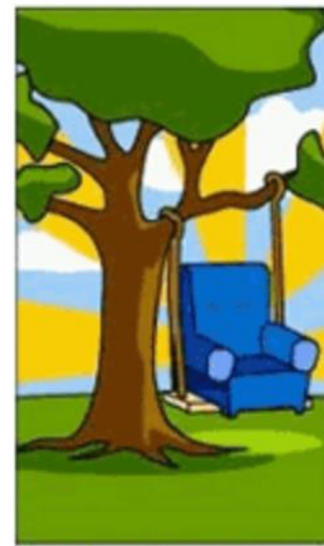
How the sales executive described it