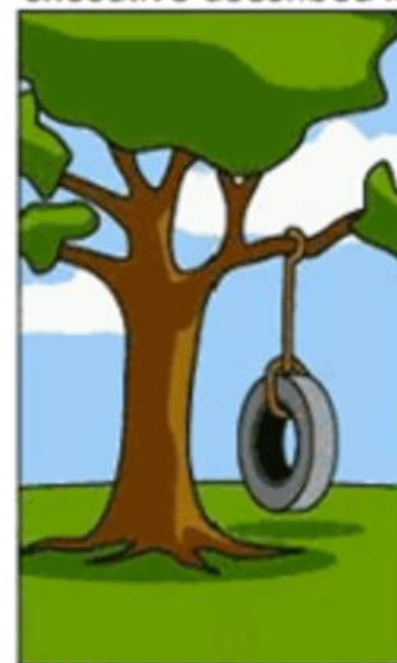
What the customer really needed