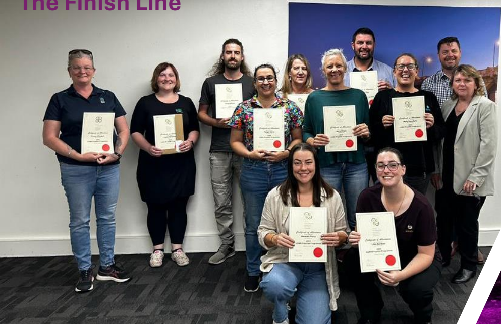
The Finish Line