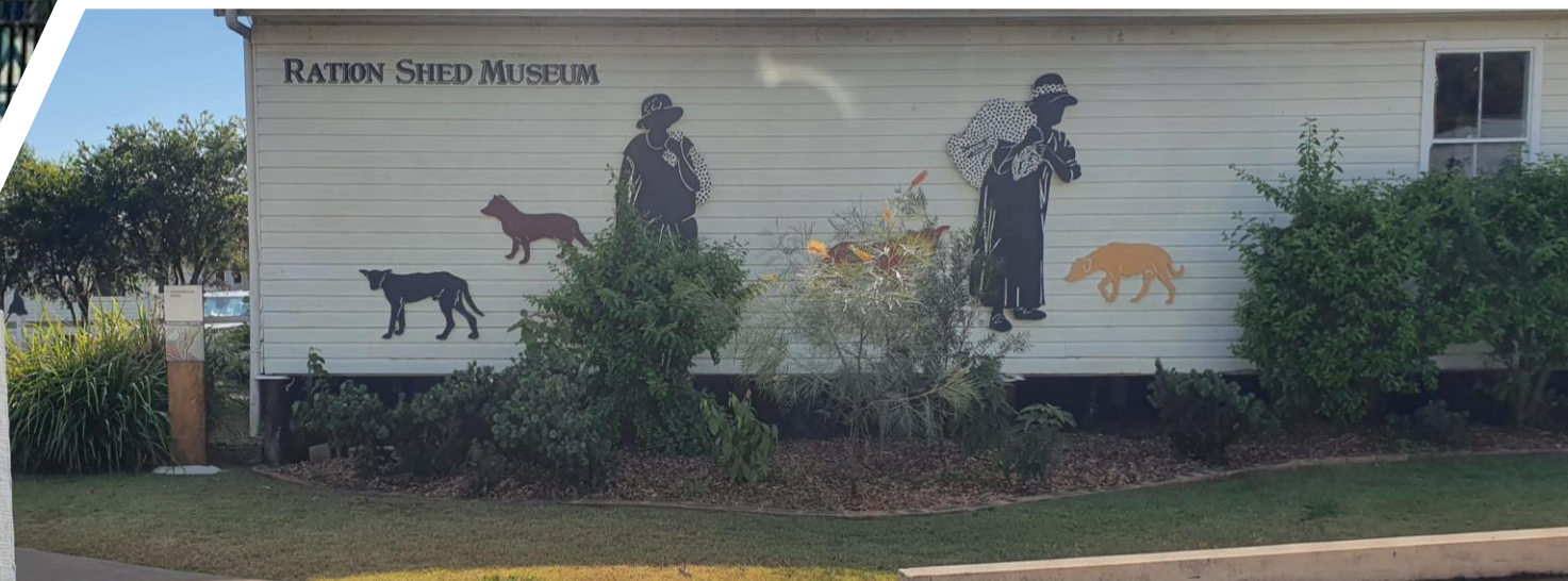
Cherbourg Aboriginal Shire Council